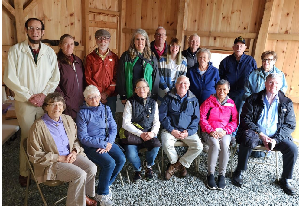
Annual Meeting Family Picture taken in the barn due to the inclement weather.