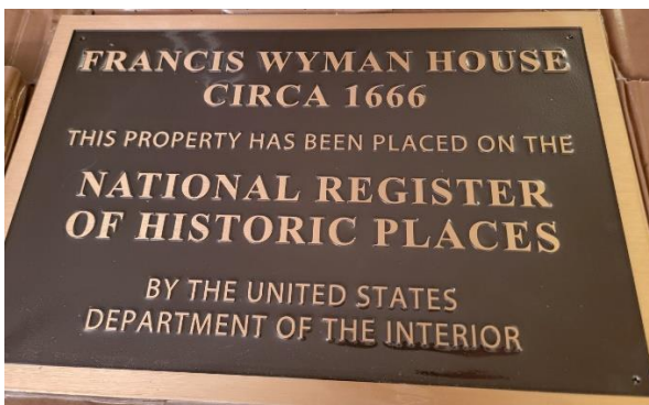
National Register plaque