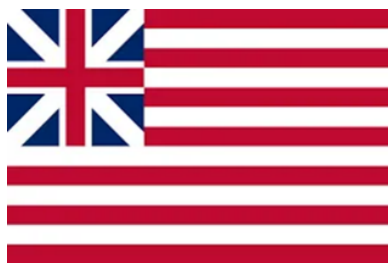
First official flag, known as the "Continental Colors" flown until 1777.

By the end of that day, 273 British Soldiers and 95 Minutemen, Militia and colonial civilians were killed, wounded, or missing. The "Shot heard Around the World" had been fired and the American fight for freedom and independence had begun. As many as 33 Wymans were involved from Lexington and Concord as well as Bunker Hill, Saratoga and other places. We have a great heritage to be proud of!