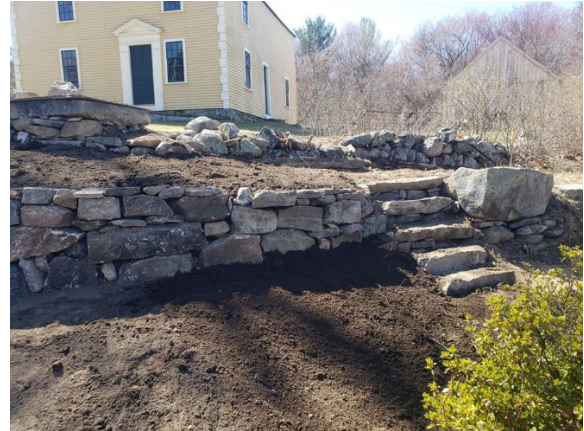
The wall work included replicating the steps NE of the well.

The wellsweep should be up in time for the annual meeting! We've completed the preparations and pieces and erecting it should be completed this month. The biggest project was reconstructing the old stone wall along Francis Wyman Road and improving the support of the granite well cap, so everything is structurally safe and sound.