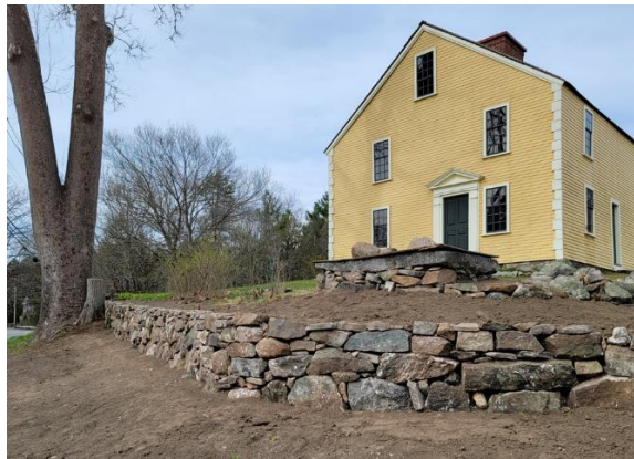
Completed Stone Wall Restoration