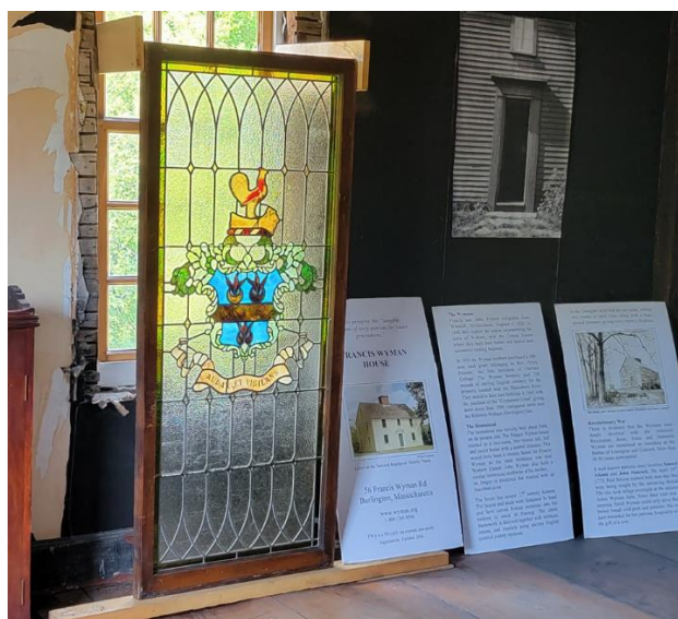
Stained glass window temporarily supported in the NW bedroom window.

The stained glass window restoration has finally been completed. Kevin Ryan from Burnham and Laroche of Medford, MA delivered the window in June and we temporarily mounted it to be backlit by a west facing window upstairs.