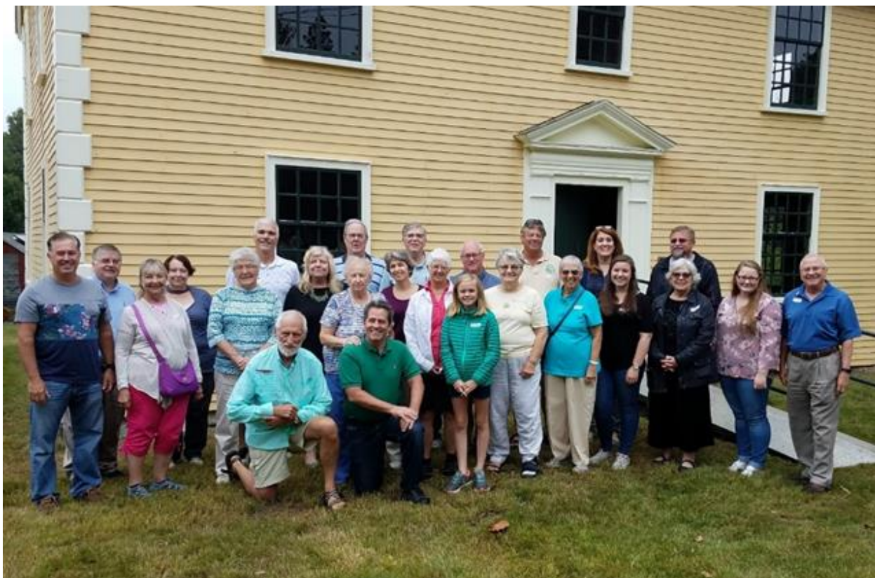
Annual Meeting 2018