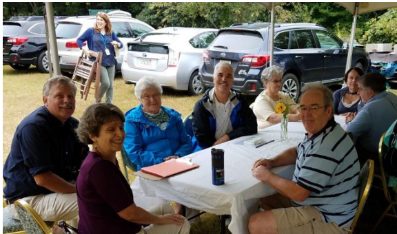
Part of the gathering at the 2018 annual meeting.