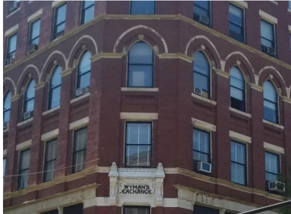
Wyman's Exchange, Central St, Lowell MA