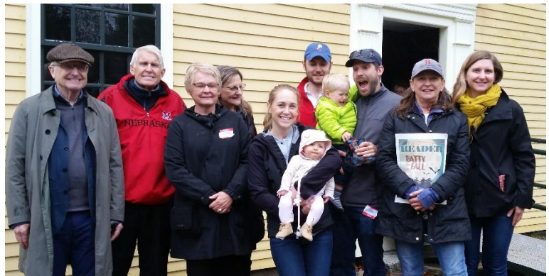
Kenagys from Washington State, Nebraska, Boston and New Zealand!